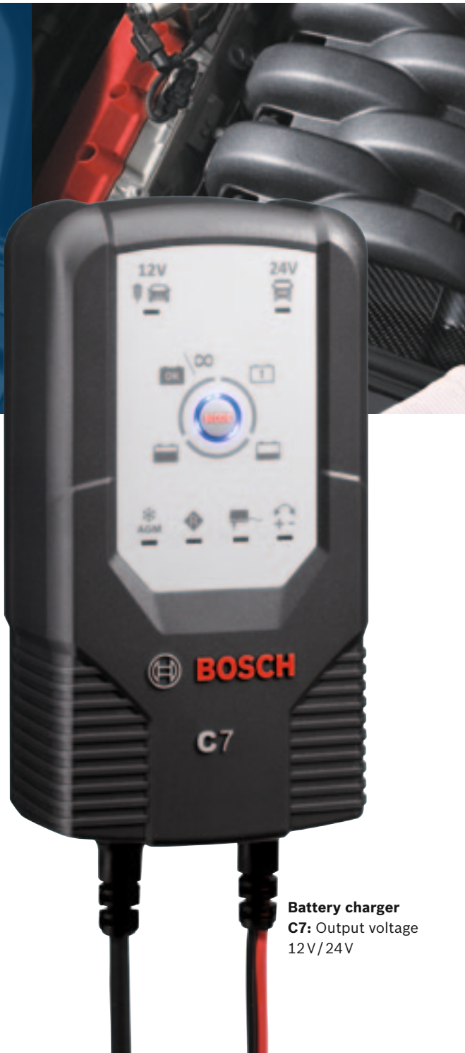
Battery charger C7: Output voltage 12V/24V