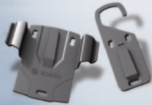
Accessories for C3 and C7: Wall mount or mobile hook