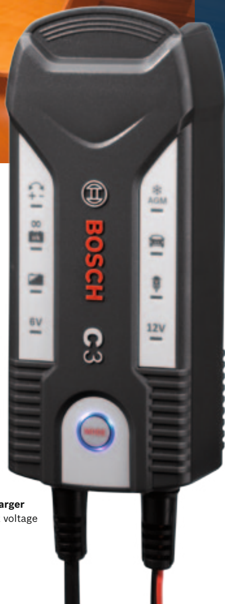
Battery charger C3: Output voltage 6V/12V

The C3 from Bosch can be used to charge weak passenger car batteries automatically and quickly. The C7 is also a good choice for those who want to keep the battery of their moped or scooter fit in the cold season with a trickle charge. The handy, compact battery charger is easy to operate with the central adjusting button and it can be hung conveniently with the supplied mobile hook, for example on the hood.