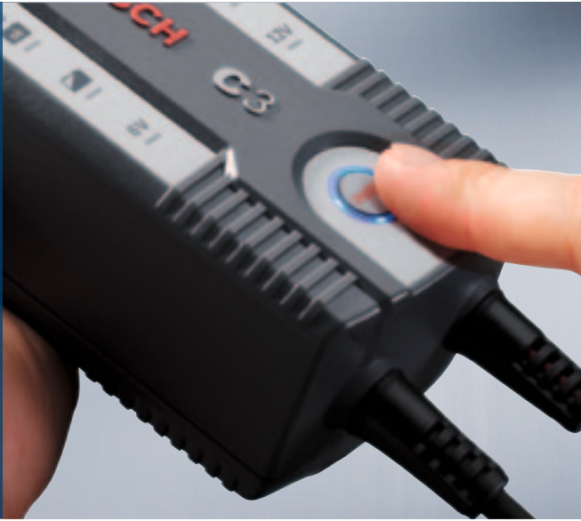
One button, many functions! Charging with intelligent monitoring