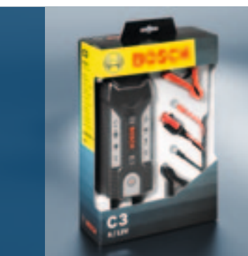
C3: All at a glance