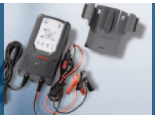
C7: With practical mobile hook