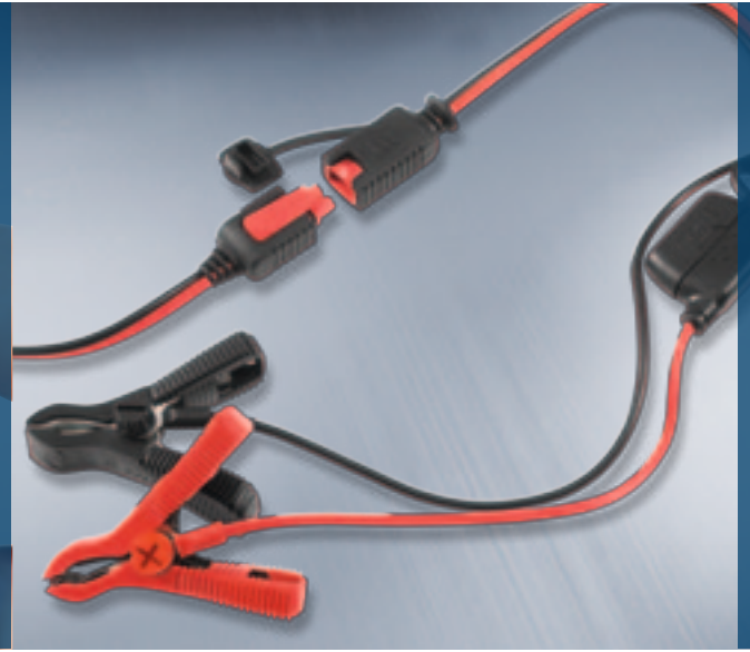
New! Battery charging cable with plug-in connection