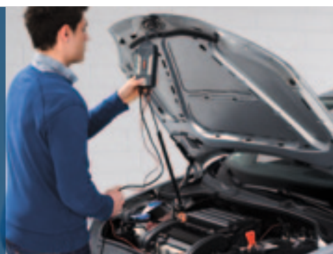
C3: With practical mobile hook