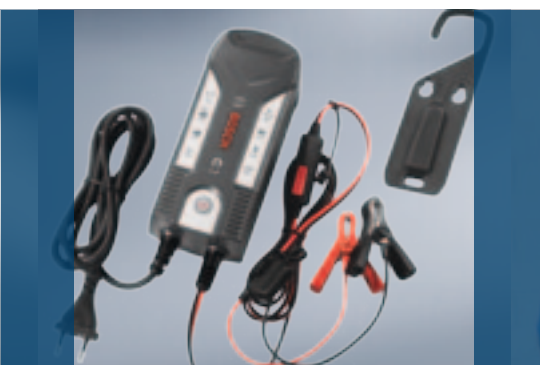
C3: Charging and mains cable, mobile hook