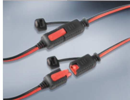
New! Cable adapter/small charger cable, including plug with fuse

Technical changes and program modifications are reserved