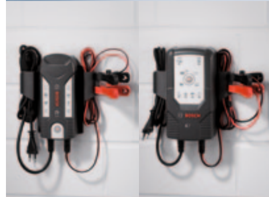
Wall mount suitable for C3 and C7: Practical storage of cables and terminals